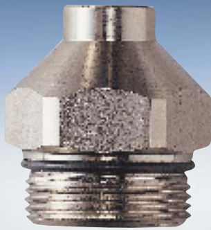
AIR COUPLER PLUG MODEL (MALE) model WVP-2WPN

Air coupler particularly designed for machine tools.