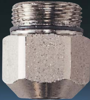
AIR COUPLER SOCKET MODEL (FEMALE) model WVP-2WSN